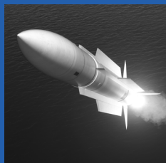
Munitions & Missiles