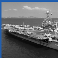
Ship Building & Maritime