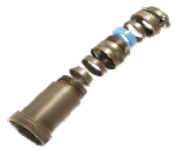
Band Lock Adapter