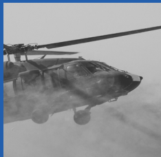
Military Airframe/ Rotocraft