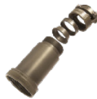
Shrink Boot Adapter