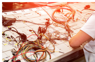
On-board Cable Testing