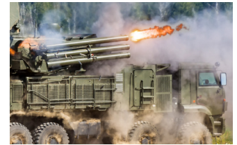
Missiles & Ordnance