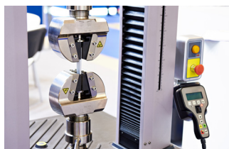
Tensile Pull Testing