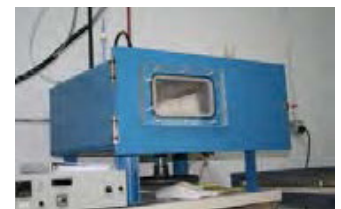
Pour Mold Potting