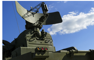
Ground Radar Systems