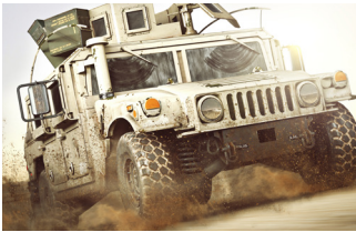
Military Ground Vehicles