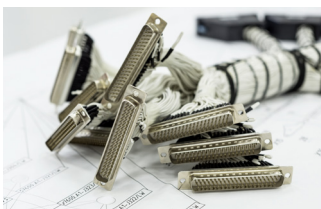
Integrated Harness Layouts