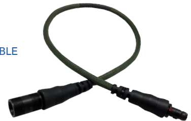
2M CONNECTOR BRAIDED CABLE NETWARRIOR ACCESSORY